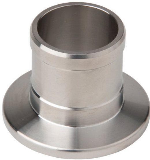
Hose adapter, aluminum, DN 25 ISO- KF