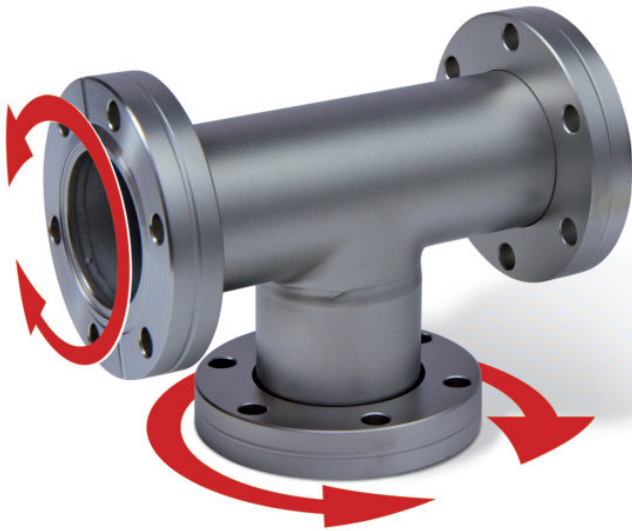
Tee, Stainless Steel 304L, DN 16 CF