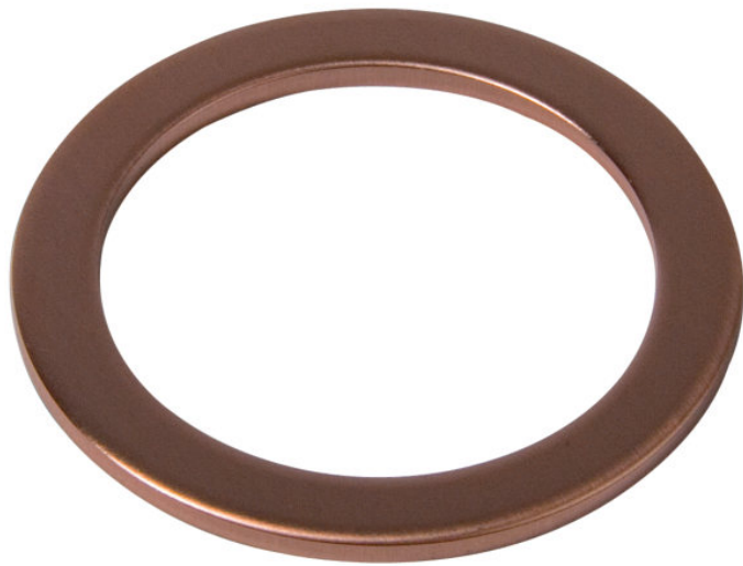
Copper gasket, vacuum-annealed, DN 16 CF