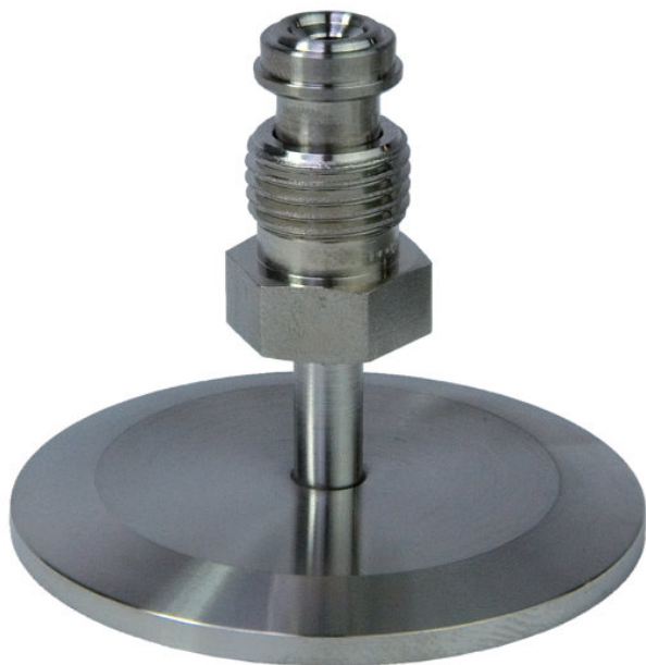
VCR-adapter, male, stainless steel, DN 40 ISO-KF